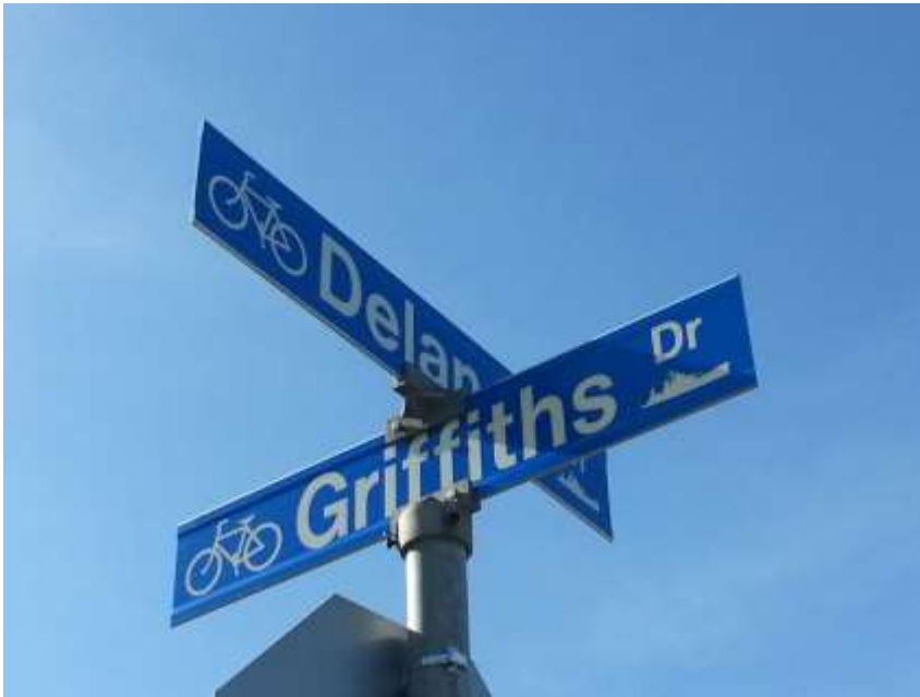
Cycling routes clearly posted