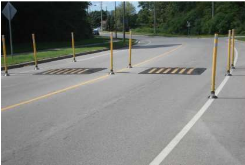
Clements Road West

Traffic calming and protection to bike lanes