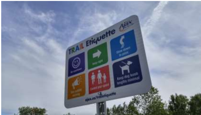
Etiquette sign for trail users