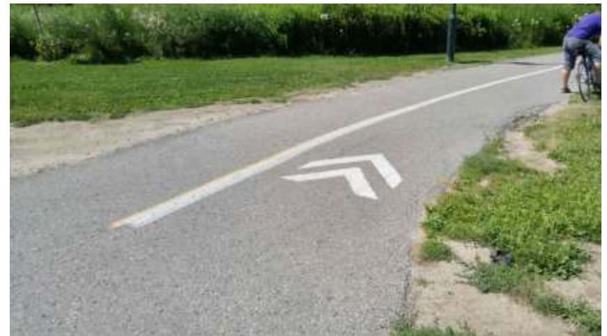
Chevrons to show lane direction