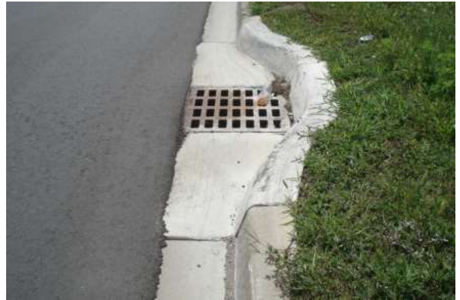
Partial Recessed Catch Basin

Traffic calming and protection to bike lanes