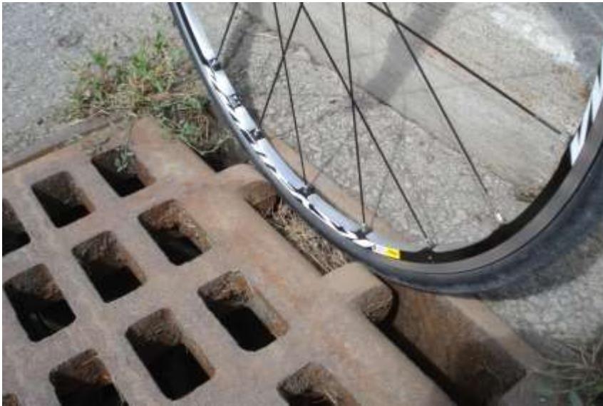
Dangerous catch basin cover