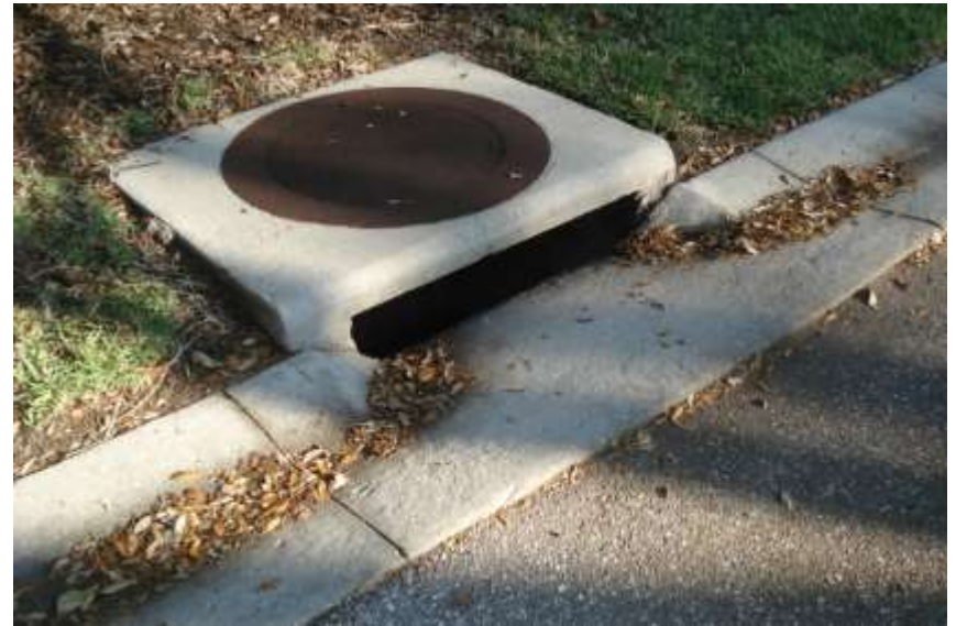
Ideal catch basin treatment