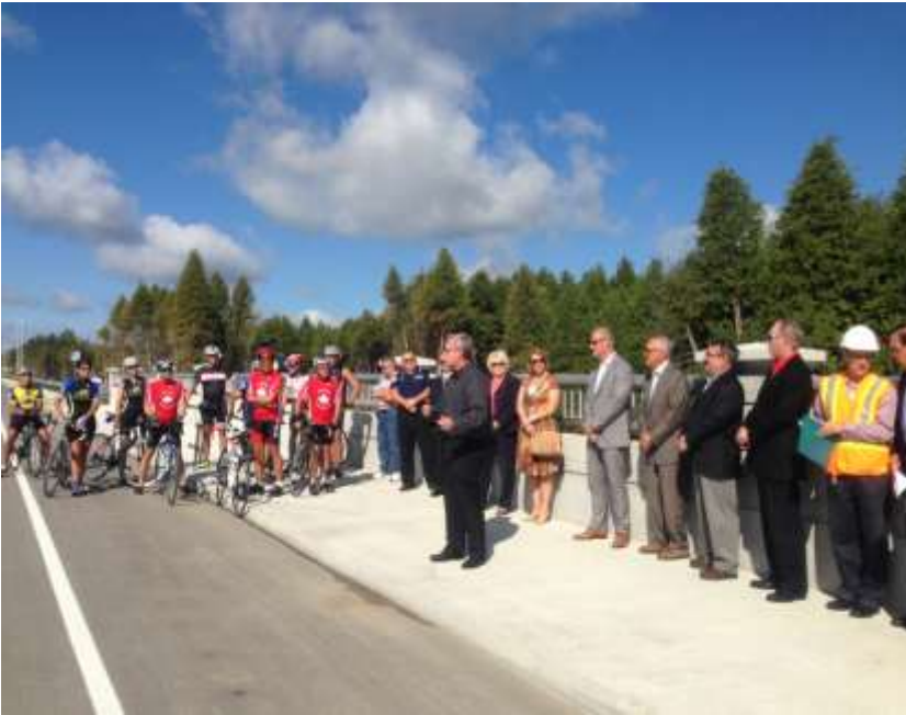
Mayor and officials