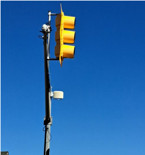
Traffic signal with radar sensor

As the Region moves to more radar-controlled traffic sensors that trigger light changes, we noticed that, at certain intersections, the radar was not picking up waiting cyclists which has always been a frustrating problem with the old buried sensors.