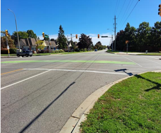
Dryden Blvd. and Garrard Rd Intersection