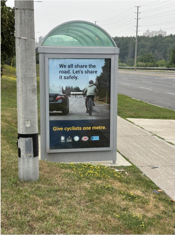
Last Year's Bus Stop Poster

We had a meeting with the Region in January regarding a repeat of last year's one meter safety campaign and are pleased to report that the Region will be rolling out a similar program this year which will run from June to September.