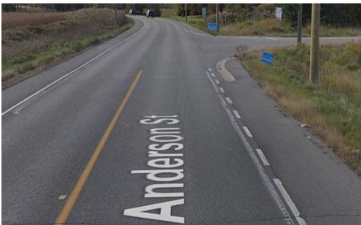
Looking South at St Thomas St.

Cycling south on Anderson St over the Hwy 407 bridge and gaining speed there is a sudden end to the bike lane and an encroaching curb forcing cyclists into the vehicle lane. After contacting the Town of Whitby to appraise them of the dangerous situation the Town has responded and has indicated that they will review the situation and possibly implement safety improvements.