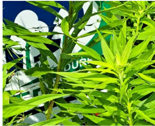
Durham Trails Sign Overgrown.