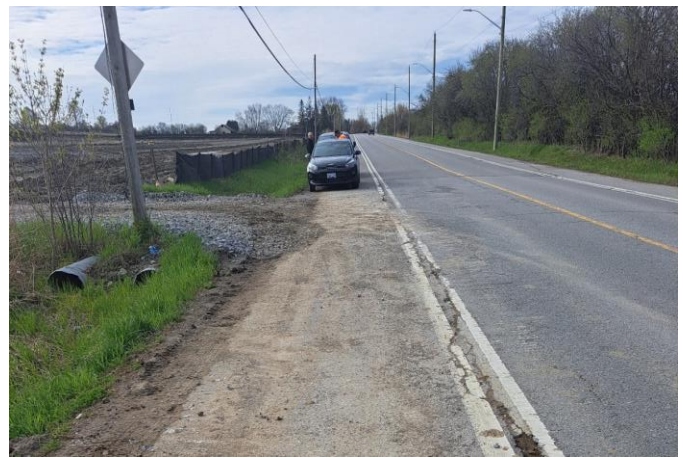
Gravel Spewed on the Bike Lane

After contacting the Town of Whitby both issues have been resolved and the bike lanes are now free of obstruction.