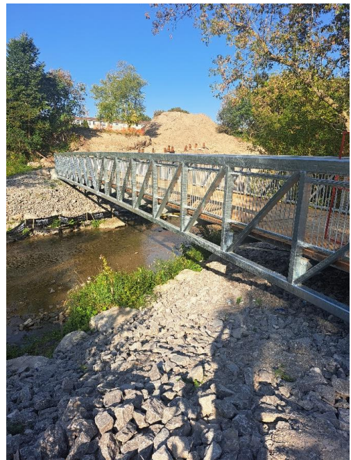
The New Bridge