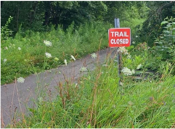
New "Trail Closed" Signs