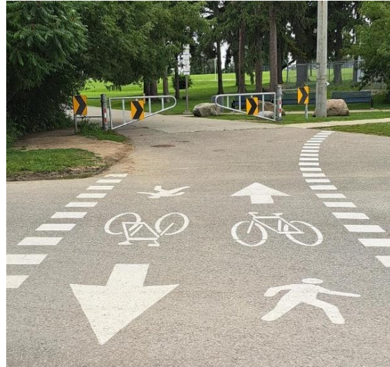
New Gate and Cross Ride