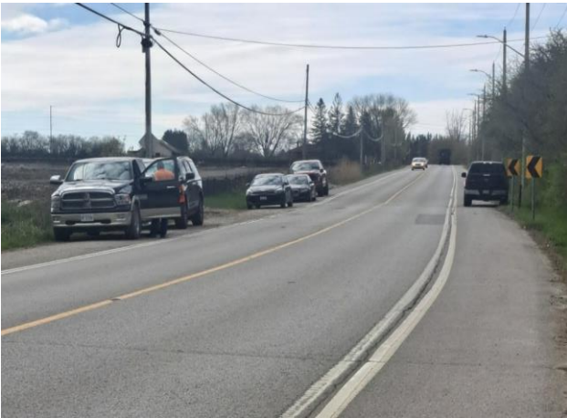
Parking in the Bike Lanes

Earlier this year construction began for a major, new residential development on the east side of Anderson St immediately north of Conlin Rd. Many of us cycle this section of Anderson making full use of the bike lanes on either side. Soon after construction began a lot of gravel and mud accumulated around the construction entrance on Anderson as well as construction workers parking their vehicles in the bike lanes on both sides of the road. This resulted in cyclists having to ride in the vehicle lanes with the inherent dangers.