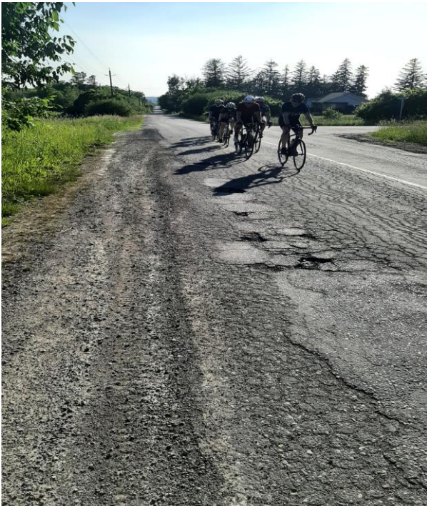
Cycling in the Middle of the Road

First brought to the attention of Pickering Council in April 2016 we again reached out to the City Engineer for any updates on future pavement improvements to Concession Rd 7 between Westney Rd and Lake Ridge Rd.