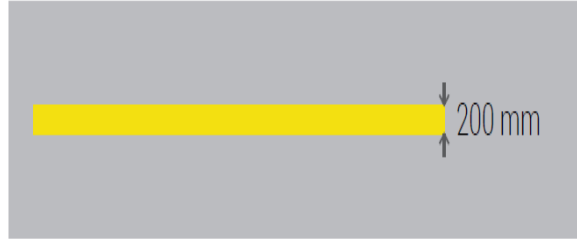
Figure 4.16 – Yellow Contraflow Lane Line