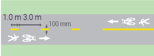
Figure 4.19 – Typical Pavement Markings for Two-Way In-Boulevard Multi-Use Paths