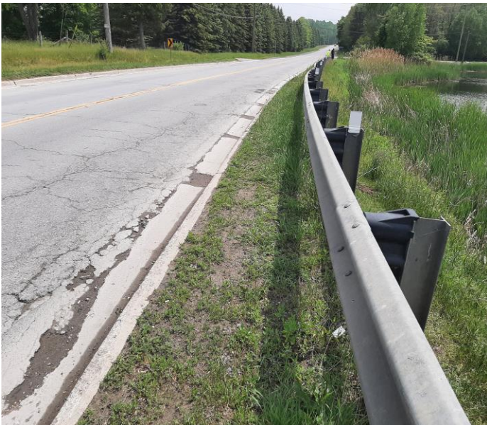
York Durham Line-Looking North

Five years ago, we identified to the Region several “gaps” in the cycling network, i.e., short lengths of unsafe roads on popular cycling routes. One gap was on the York Durham Line between Aurora Rd and Wagg Rd. When it came to our attention that the Region was planning to reconstruct this section of highway, we reviewed the proposed design and were aghast to find that no cycling infrastructure had been included.