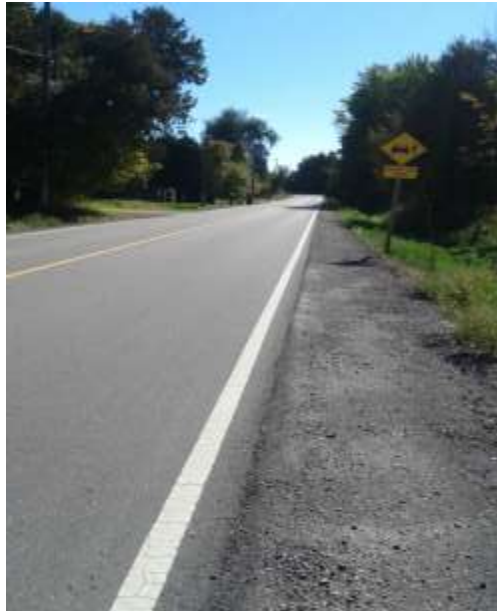
Smooth surface Share the Road signage