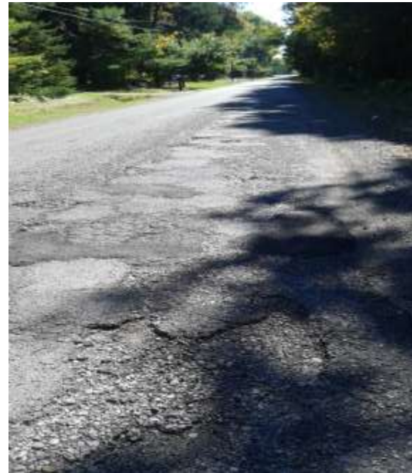
Broken pavement Forced to ride in centre of road