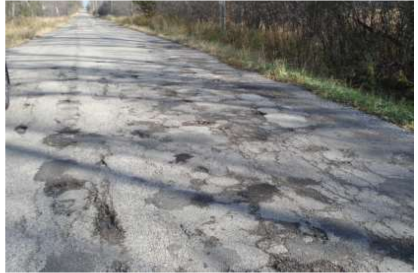
Third Concession Rd – Broken pavement, pot holes