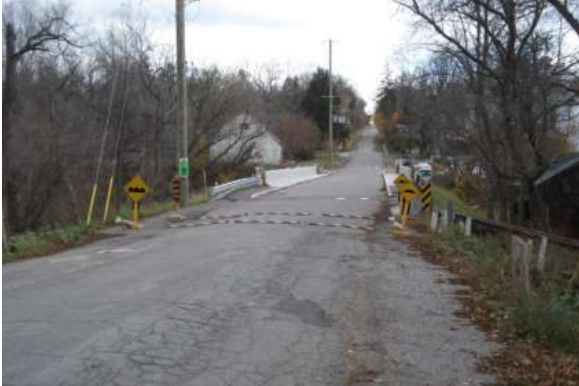
Whitevale Rd traffic calming - no bike gaps

Whitevale Rd - surface deterioration. Cyclist can't maintain safe line