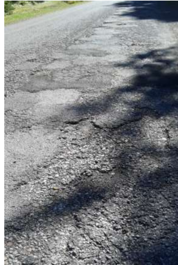
Greenwood Rd. - Surface Deterioration Forced to ride in centre of road with blind corners