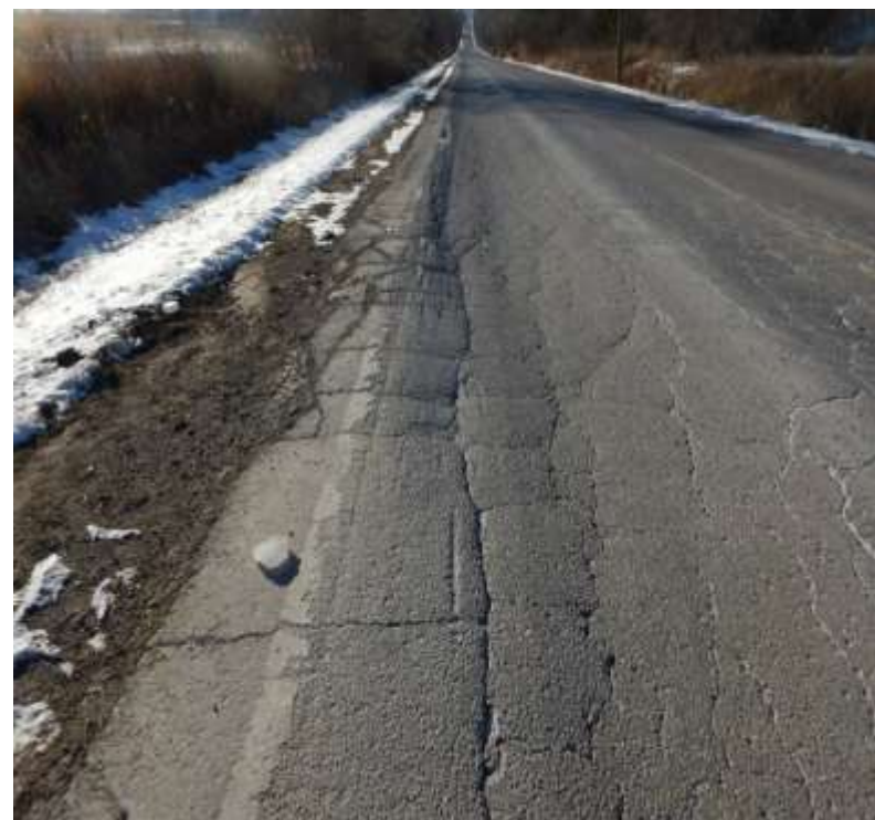
Conc. 7 Westney to Salem - wheel trough, ruts, broken asphalt